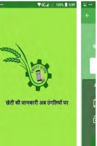
Community Radio (CRS) of BAU, Sabour